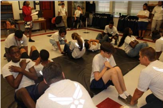
6 th period Cadets are conducting curl-ups (sit-ups) as part of their annual physical fitness assessment.