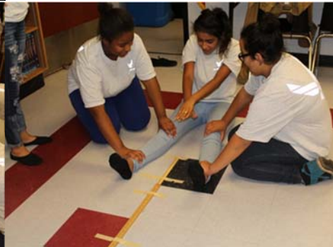
6 th period Cadets are conducting the V-Sit reach as a part of the Presidential Physical Fitness Assessment.