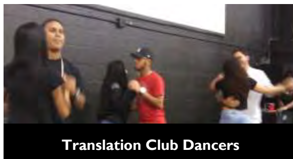
Translation Club Dancers

Thank you to everyone who contributed to FSA Parent Night. Fish Fry was great. Parents, students and community members were able to hear and receive a lot of good information and enjoy good fellowship and food!