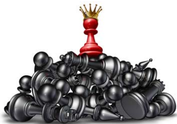
Chess Tournament News